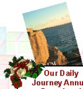
Our Daily Journey Annual Devotional R 99