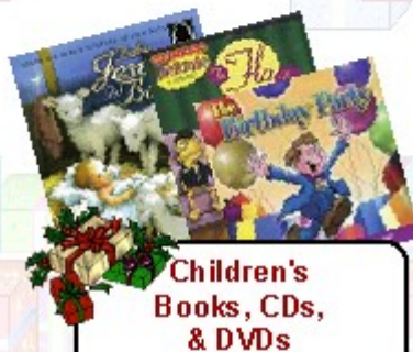
Children's Books, CDs, & DVDs