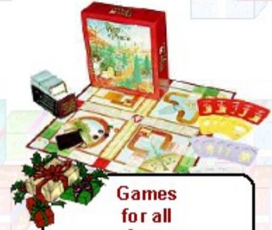
Games for all Ages