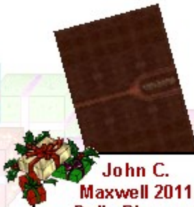
John C. Maxwell 2011 Daily Planners R 140