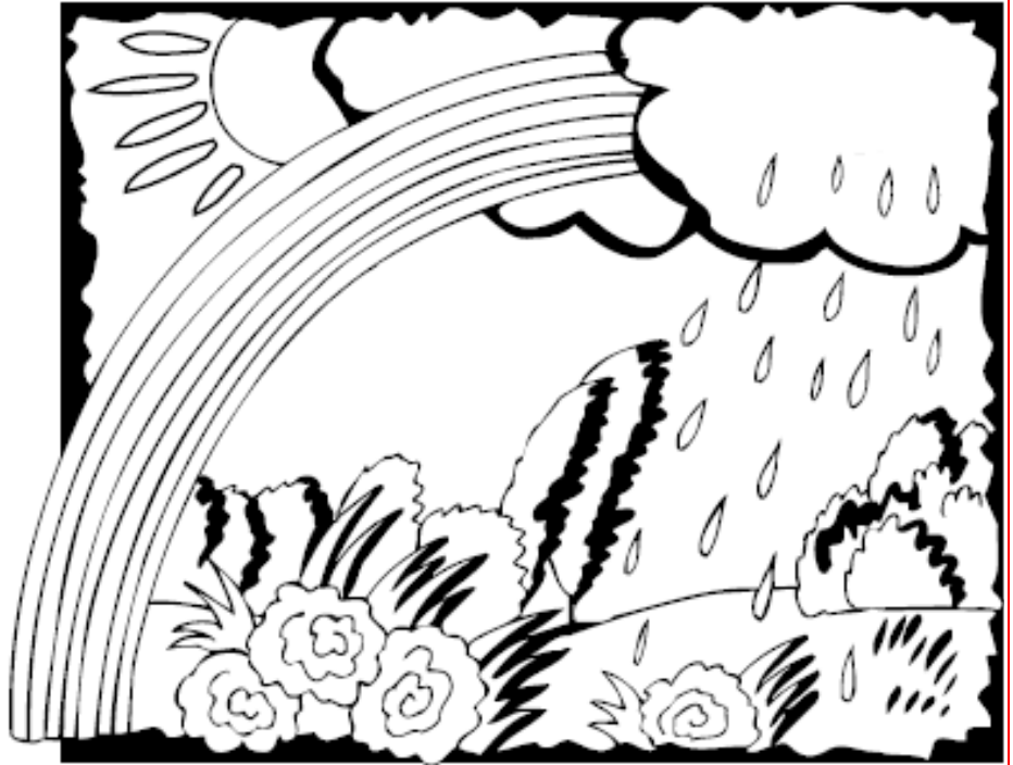
The Rainbow... God's Promise.

"I have set my rainbow in the clouds, and it will be the sign of a covenant between me and the earth.... Never again will the waters become a flood to destroy all life." (Genesis 9:13,15).